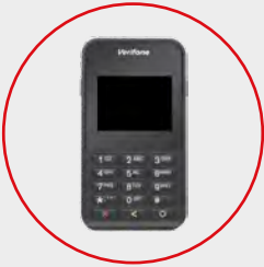
VERIFONE E355 Discreet mobile POS