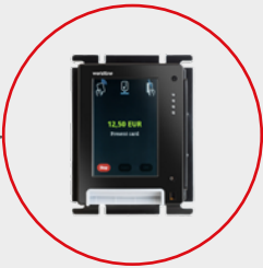
VALINA All-in-one Kiosk solution