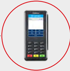
VERIFONE P400 Fast. Reliable. Secure.