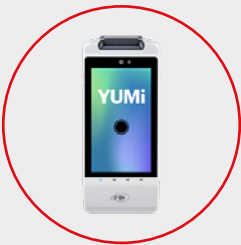
WORLDLINE YUMI 360 degree Android