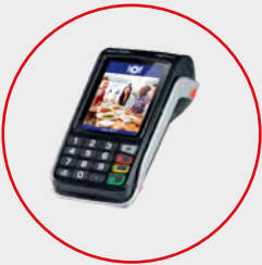
INGENICO MOVE 5000 Flexible. Robust. Portable.